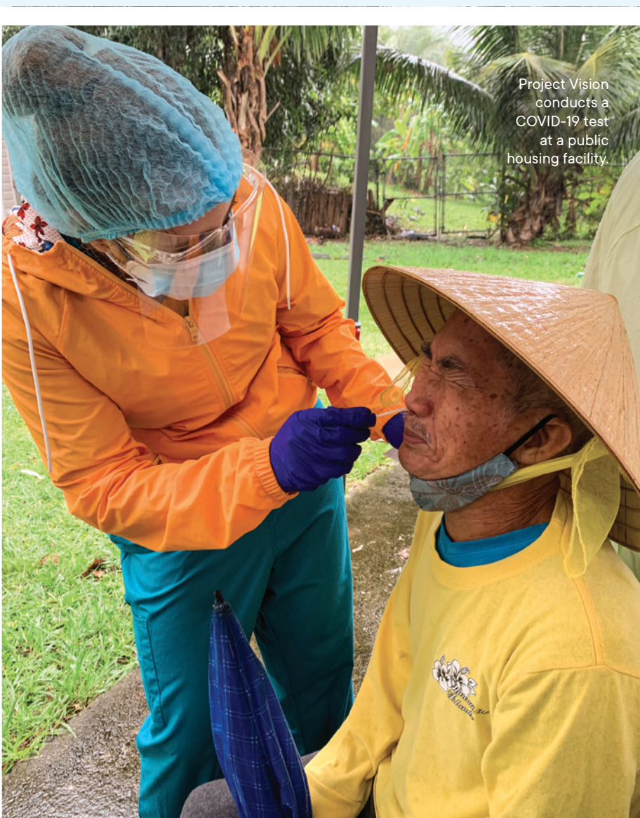
Project Vision conducts a COVID-19 test at a public housing facility.